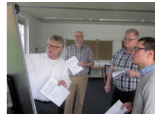
Photos: Working groups at previous seminars in Montabaur